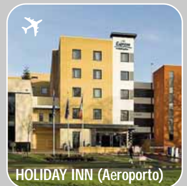
HOLIDAY INN (Aeroporto)